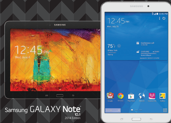
Samsung GALAXY Note ™ 10.1 2014 Edition