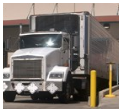
What is IRP?