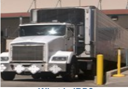
What is IRP?