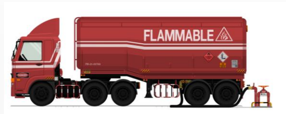
Tank & Hazardous Materials (X)