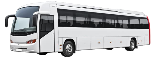
Passenger Transport (P)