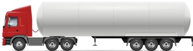
Tank Vehicle (N)