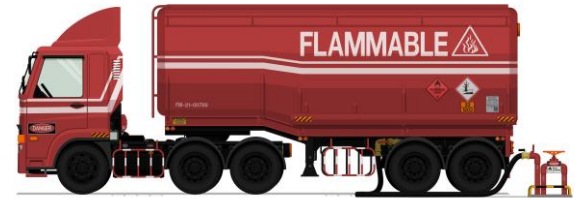
Hazardous Materials (H) (any size vehicles)